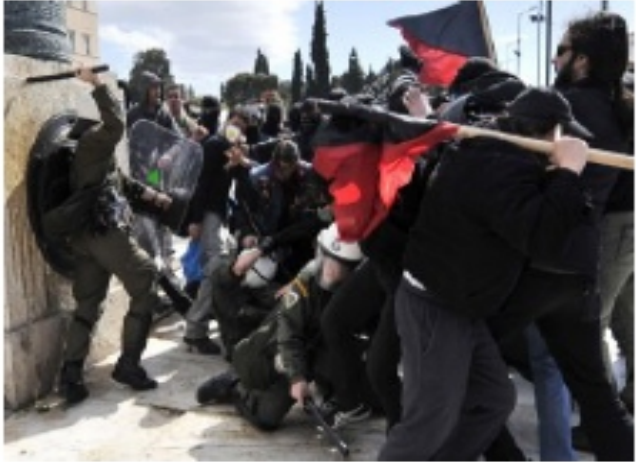
A common sight

The fascist's -Golden Dawn- legitimate entry into Parliament with 7% of the ballot using an anti-immigration campaign and taking advantage of the Greek economic crisis should be of great concern to the anarchist movement. With the support of the police they have launched a terror campaign, the latest atrocity being the murder of a young Iraqi stabbed by a group of 5 nazis with no arrests being made to date. The modus operandi is the same as in the dozens of attacks committed in recent months against immigrants not only in Greece but in many other European countries.